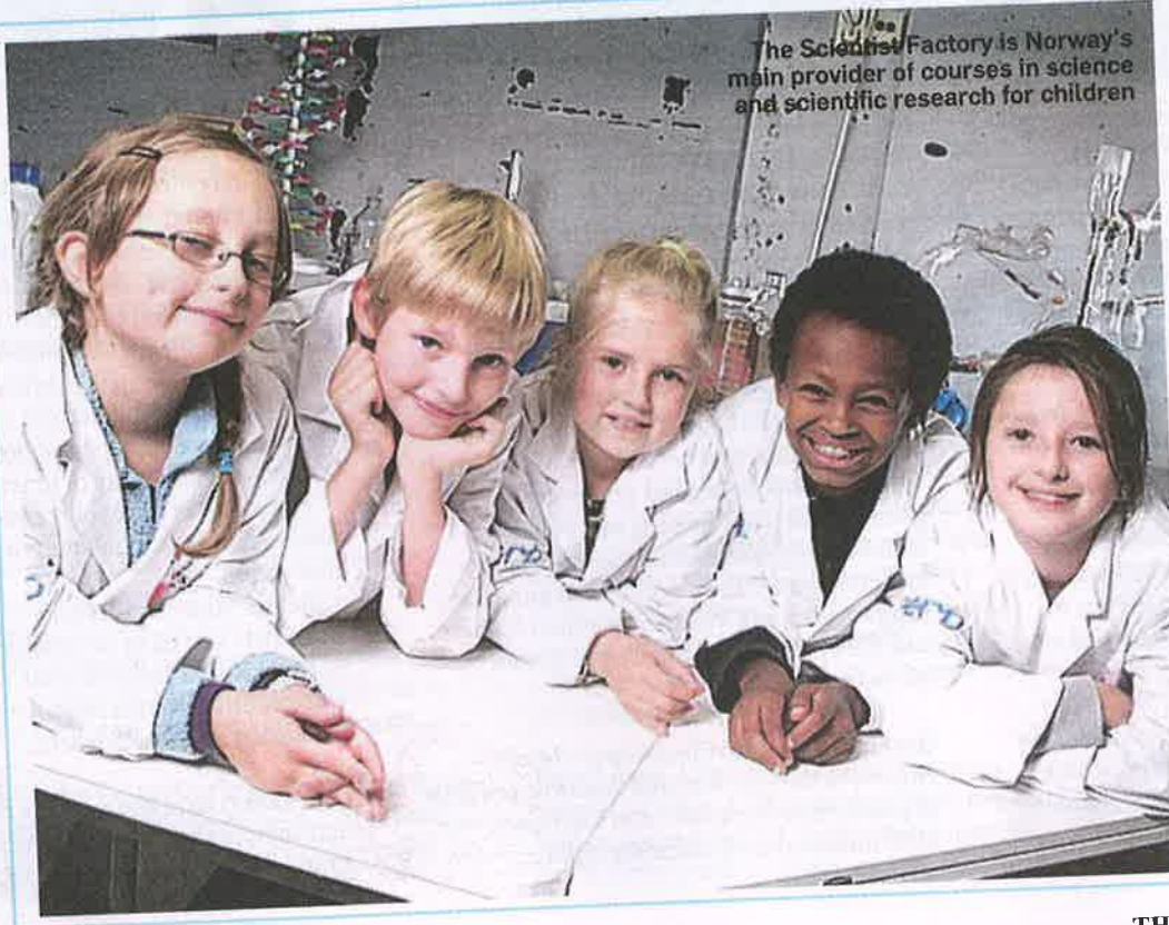
The Scientist Factory is Norway's main provider of courses in science and scientific research for children